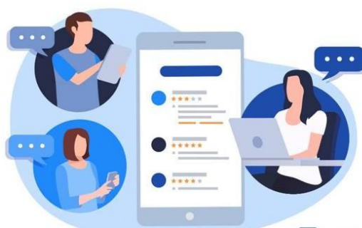
Figure 1. Methods and Design of the Research

This study used quantitative research to examine how Instagram and WhatsApp promotion techniques influenced consumer interest in buying home-cooked meals. A survey-based methodology was used to gather information from a sample of customers exposed to promotions for home-cooked meals on major social media sites (Feng et al., 2015; Feng & Xie, 2019).