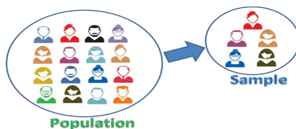
Figure 2. Data Collection and Sampling